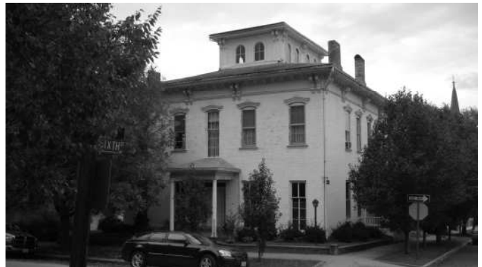
The Lamb-Munger House circa 1859